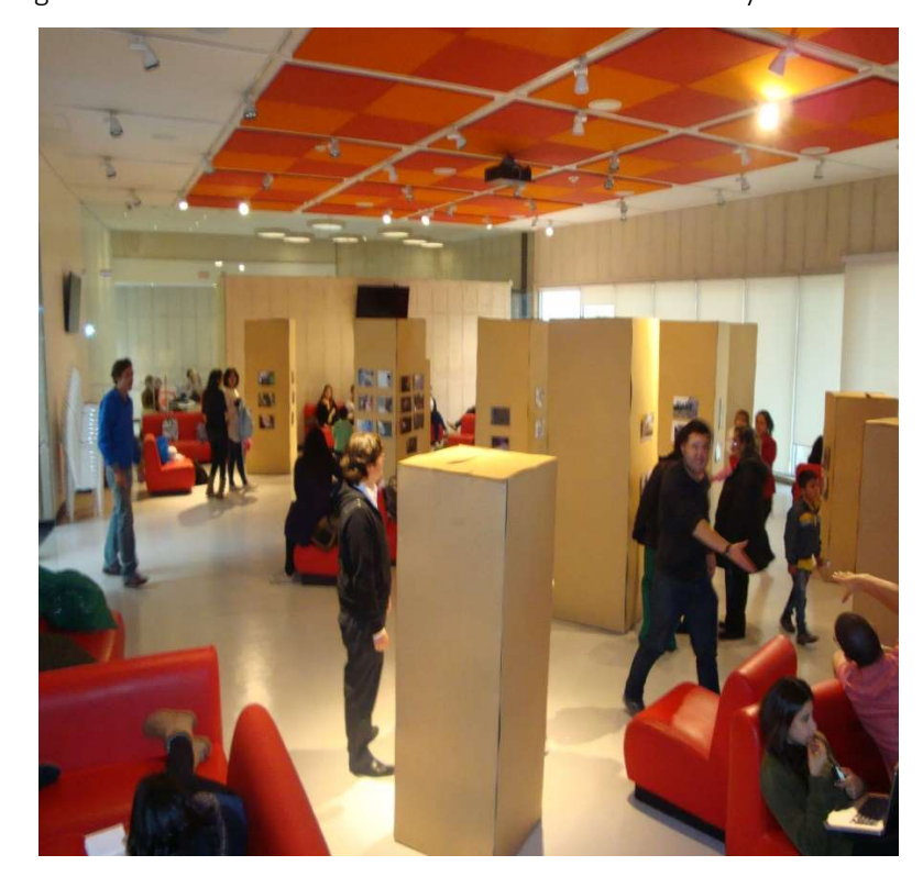
Figures 3 and 4. The exhibition at the Javeriana University.

For the application of the photo-elicitation technique, an exhibition was set up in a place other than the children's homes. It took place in a show room at the Javeriana University. The photographs were organised around the four attributes of the housing living conditions explained earlier. (Figures 3 and 4). The exhibition remained open for the general public during a week, and on a day the children participating in the programme and their families were invited. When the children arrived at the exhibition with their families, they went right away to look for their work and started describing what they saw in the images. This moment was very important because it allowed complementing the subsequent conversation held with them, and we had the chance to speak with the kids and to develop the second step of the photo-elicitation activity: ask them questions about the photographs they had made. (Figures 5 and 6).