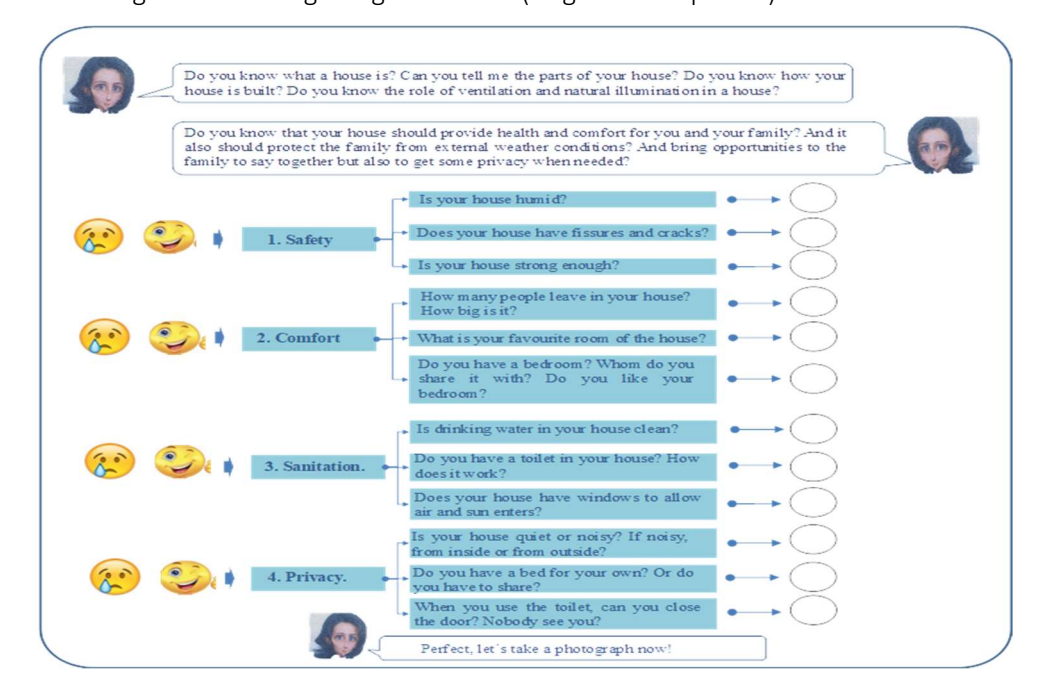
Figure 2. Housing living conditions (original is in Spanish). The authors.

The first part of auto-photography dealt with the explanation of the housing conditions, following to Tarchopulos and Ceballos (2003), as explained earlier. The following illustration (figure 2) was used: