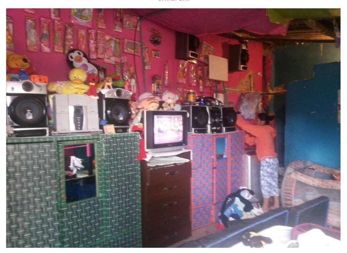
Figure 11: A child's shared bedroom, showing the impossibility to have some privacy. Author: The children.

Along with the development of the second part of the methodology (photo-elicitation), which involved the family, the importance of the aspects analysed in the first part is confirmed: safety, comfort, sanitation and privacy. However in this second phase, new topics were raised by the children and families: spaces for recreation and those that can provide a food source. The absence of spaces to play actively inside the dwellings meant that the main communal living area of the barrio was used as a recreational space. In relation to food sources, the presence of spaces devoted to urban agriculture becomes a "life insurance policy" since residents can grow food in their houses that they can contribute to their daily subsistence.