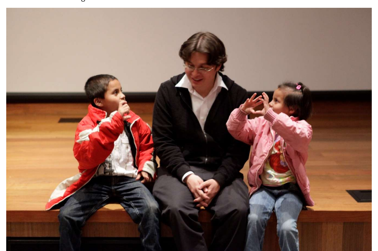
Figures 5 and 6: In conversation with the children. The author.