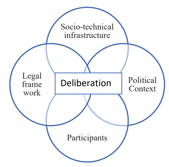
Figure 2: Deliberation in a multi-dimensional

This model provides a framework to understand the determinants of deliberation and evaluate the quality of discourses in the online sphere. As a consequence of the multidimensional nature of deliberation, the realisation of deliberative standards can be seen as a social, economic and as well a political task. Consequently, it is crucial to think about potential paths how to use the Social Web to provide the infrastructure for deliberative online platforms. The next part takes a deeper look at specific cases in the economic and political sphere and identifies key gaps and potential paths how to realise large-scale online deliberation.