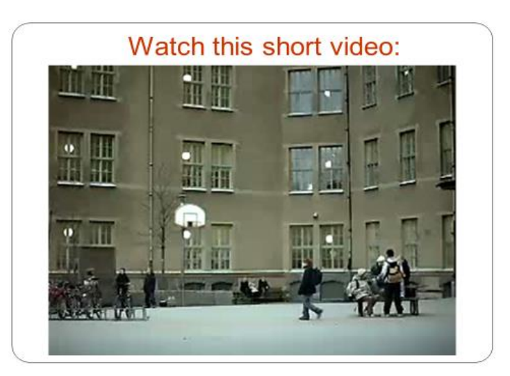
Fig. 2 - Video for oral comprehension (listening) activity

The final part of the reading comprehension questions discussion opens the way for the activity on listening, which comes next. The proposed text is a video produced by the Canadian NGO family.ca (TAKE, 2004), which shows a situation of bullying. Figure 2 below represents the first image of the video: