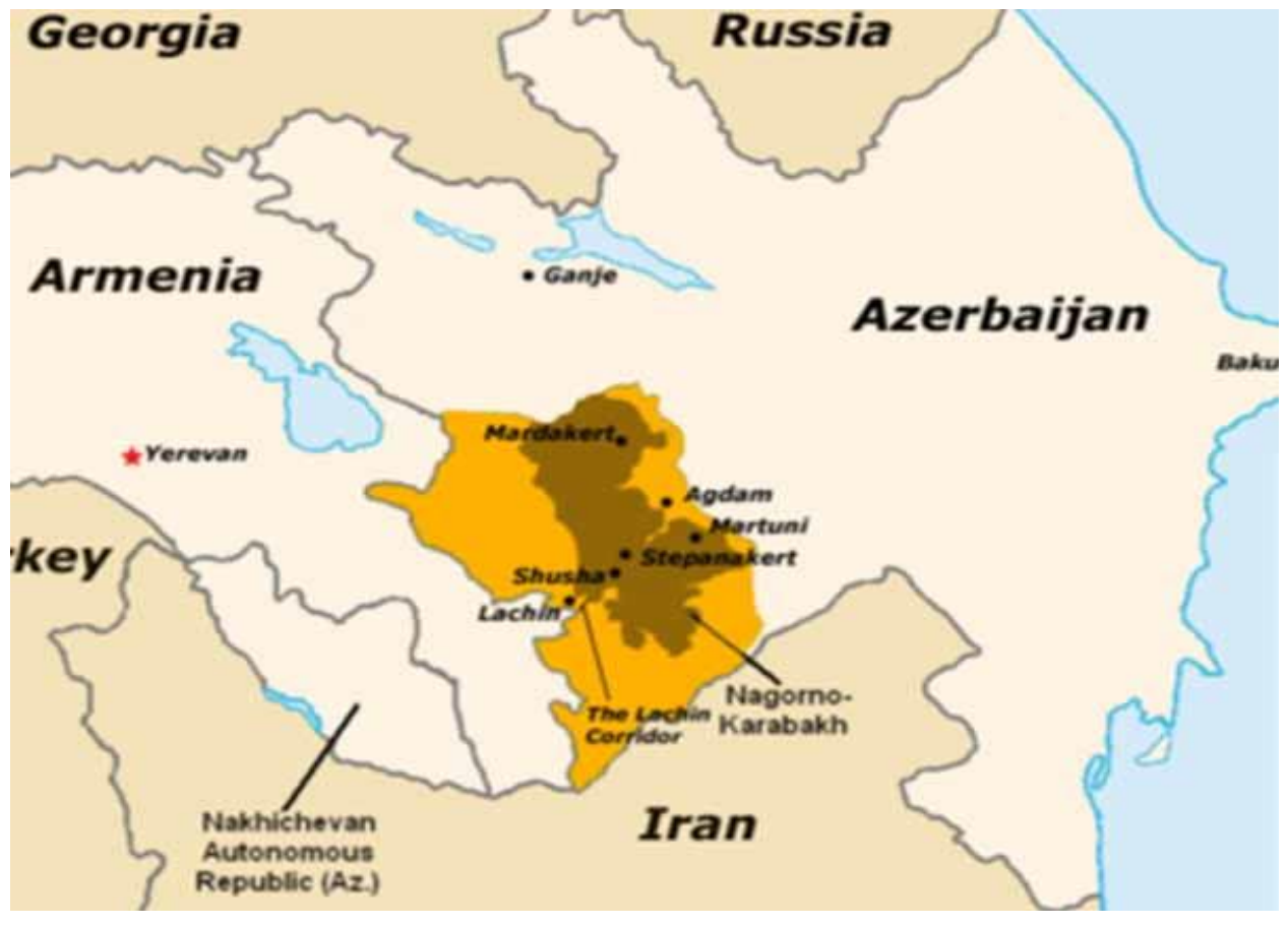
Map extracted from the Nationalities Papers of Cambridge University Press via Wikipedia (<u>https://www.cambridge.org/core/journals/nationalities-papers/information/nagorno-karabakh-articles-from-</u>nationalities-papers) consulted on 3<sup>rd</sup> October 2021.

Map of the Nagorno-Karabakh Republic after the end of the First War (1994) showing the territories controlled by the Armenians until 2020