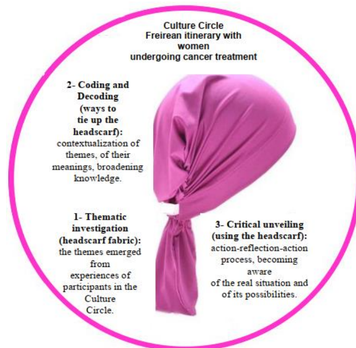
FIGURE 1: Freirean Itinerary: analogy to the use of the scarf. Brazil, 2020.

To start VCC, an analogy was made concerning the use of a headscarf, an object that has been naturalized by the participants as a symbol of their resistance, since, just as the headscarf needs fabric and sewing for its making as well as wisdom for its tying up, so that its use can be efficient, it is understood that nursing care also needs to be fixed on the particularities of the reflections of those who experience the challenges from cancer and the constant threats imposed by COVID-19. From this perspective, the Research Itinerary was conducted with lightness, creativity, dialogicity and depth in the stages that support it, which were interconnected during VCC, as exemplified in Figure 1.