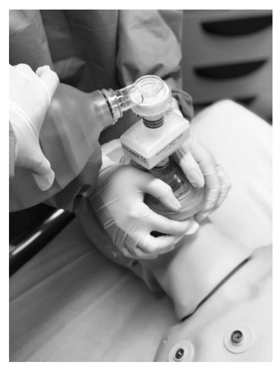
FIGURE 1: Technique used for manual ventilation with BVM, using two health professionals. Source: The authors. Rio de Janeiro - RJ, Brazil, 2020.

Manual ventilation with BVM or endotracheal tube-bag should be avoided, due to the high risk of aerosolization and contamination of the team. In situations of extreme need for ventilation with BVM, the technique for sealing the mask should involve two professionals, using an oropharyngeal airway<sup>12</sup>.