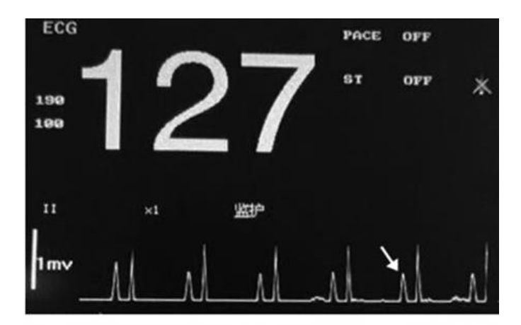
FIGURE 3: P-wave amplitude exceeding the QRS complex, a phenomenon that can be verified when the catheter tip reaches the cavoatrial junction<sup>29</sup>.