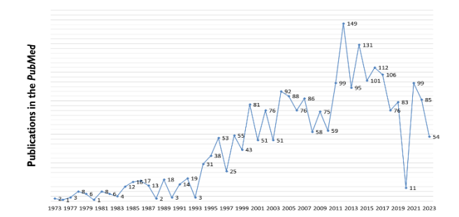
Figure 1: Revisional publications with the keyword "Junction Comunication". Quantitative survey of the number of publications per year in the PubMed database using the keyword "Junction communication", searched on october 18, 2023 at five thirty-two minutes. Research 08/18/2023. Total: 2395.